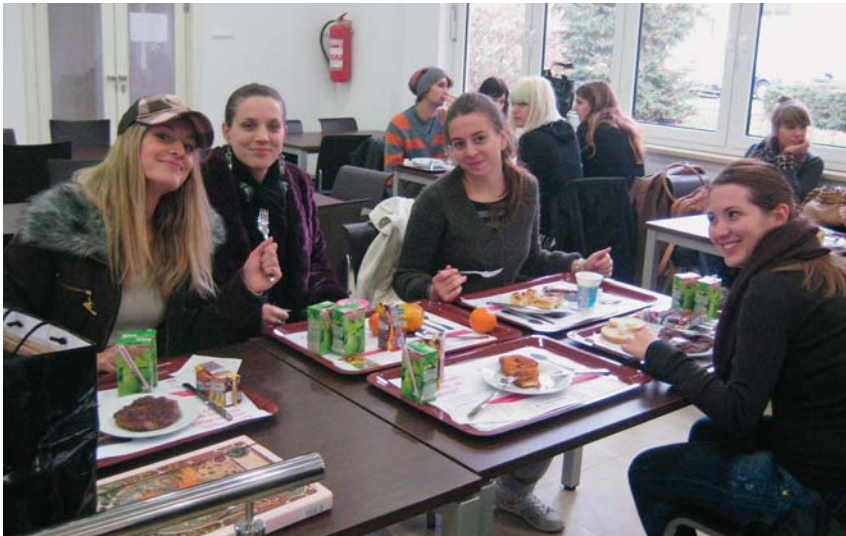
Student restaurant - student's favourite meeting place at the Faculty of Textile Technology

dance with the Statute of TTF and the Statute of the University of Zagreb. The development vision of TTF is based on the following guidelines: „ Work excellence should keep this Faculty at the top position among scientific research institutions, teaching staff should be adequately awarded for its work, and for students to remain the pride of this Faculty, the University and Croatia. The relationship among the staff in our scientific institution should be friendly and caring. Furthermore, our task is to strengthen scientific research potentials and to promote excellence, recognition, quality and internationalisation. The further priorities are to modernize and adapt curricula according to European and global experience and existing trends. It also includes better system of course organisation, continuous and complete joining in international projects, creation of mutual programmes with faculties from abroad based on so far good partnership experience (i.e. the development of bilateral cooperation and projects). A new project called Working paper series – Textile & Design has been launched and particularly arranged for young scientists and mentors of the Faculty. A virtual magazine TE-DI will have been for the first time issued on the Faculty's Day on 25 January 2011. Further development and affirmation of scien-