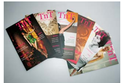
Students' magazine T'n'T

and sports section which regularly participates at technical faculties' competitions. We are not the best ones, but always the winners in fair play. Students are also given an opportunity to participate in scientific researches for which they were often awarded. Students of design courses regularly organise fashion shows and exhibitions. Their well-received project was the one of complete costume design and construction for the opera The Magic Flute by W.A. Mozart, performed at The Croatian National Theatre in Zagreb.