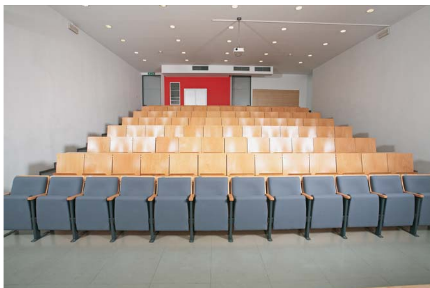
Faculty of Textile Technology inside

During the last decade, as a part of development strategy, room capacity has been enlarged, modern equip-