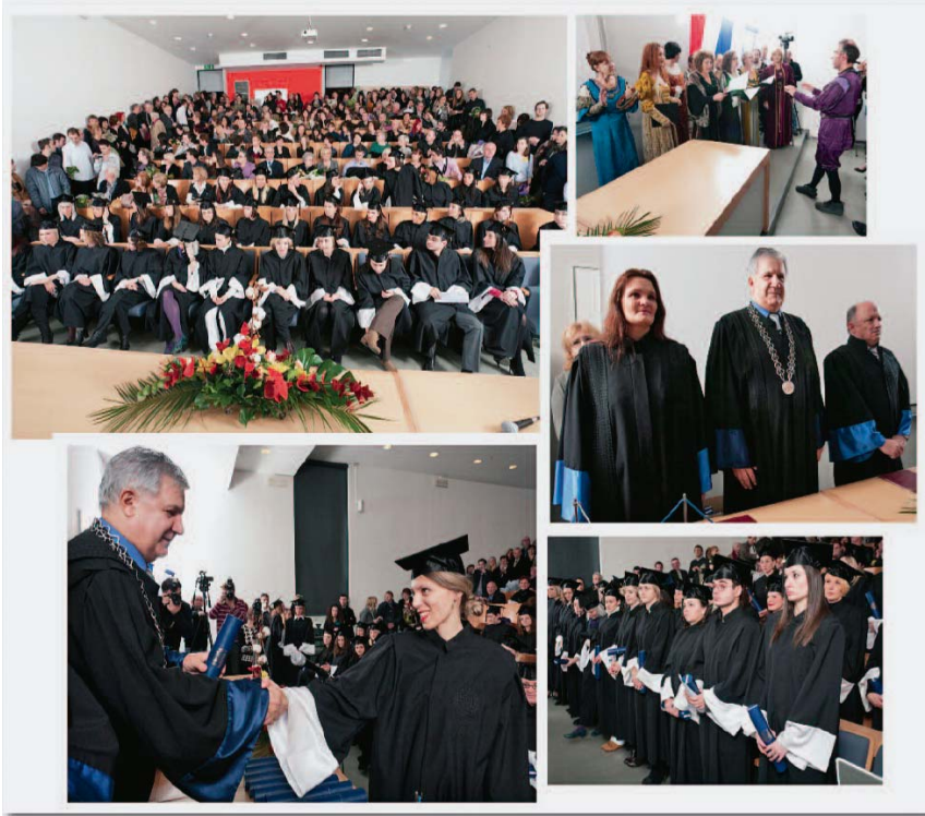
Bachelor of science graduation ceremony at the Faculty of Textile Technology in Zagreb

proach to solving problems. They are also qualified to design, organise and lead the processes in textile companies in all parts of textile technologies. On the other hand, they become competent and able to estimate art and design values of a product and to give suggestions for improvements in this aspect of production.