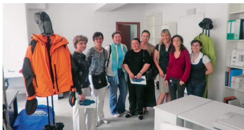
Visit to new premises of additional partner: SME - Grado Zero Espace (GZE), Montelupo, Italy, 2010