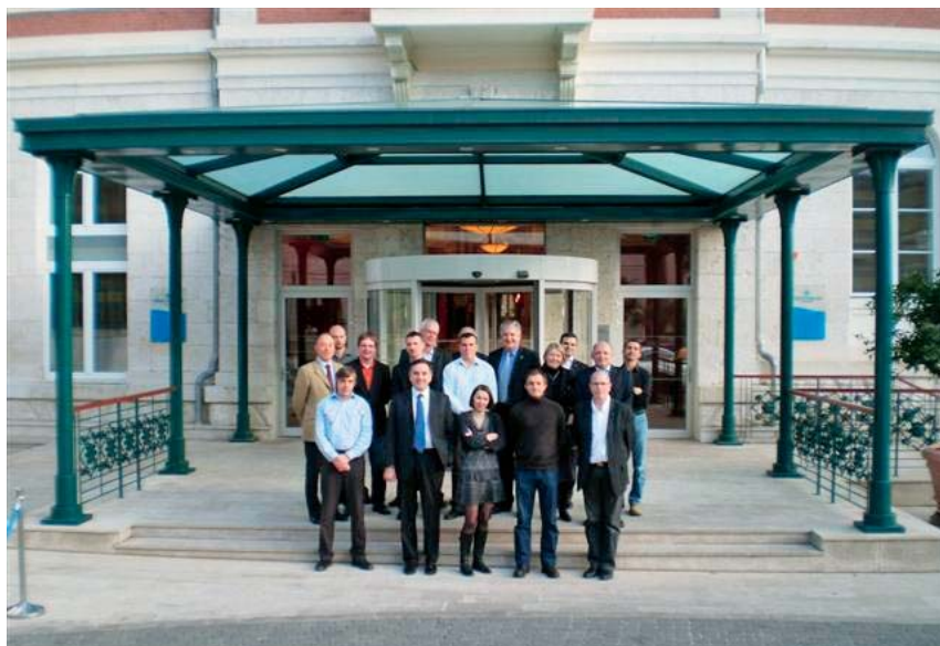
Pre kick off meeting of project partners MAPICC 3D, 2011

Scientists and researchers of The Faculty of Textile Technology realised the importance of joining EU projects on equal basis, so by introducing Service of Textile European Projects (STEP) they made a considerable move in order to coordinate those activities. The