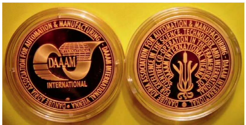
DAAAM International gold medal

The field of Textile Chemistry Engineering with project tasks which include : multi-functional materials and ecological processes of textile finishing and care, multi-efficient textile materials, ecologically favourable processes of cellulose modification, dyeing in the processes of sustainable