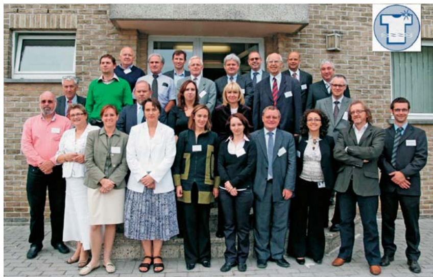
Kick-off Meeting of the SMILES Consortium at the head office of project coordinator FBT in Brussels (EU), 2007

Thus, the significant results are evident, appreciable and impressive. Throughout more than a decade 17 bilateral projects have been carried out by eminent scientific and professional organisations from the world of textile (Austria, Belgium, Hungary, Slovenia, Great Britain and Serbia). In the strategy of textile and clothing economy development of Europe un-