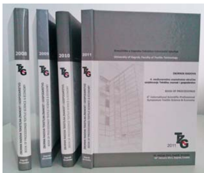
Book of Proceedings of the TZG 2008-2011

Five years ago a significant fashion-stage activity of our Faculty called Fashion Wardrobe was launched. The events took place at several prestigious locations in Zagreb. The Fashion Wardrobe also organises a young designers contest in Croatia, having role model in MittleMode and Royal College of Arts . Today the Fashion Wardrobe has become an internationally recognized event. It gathers fashion design professionals from all over the world, which places Zagreb and Croatia on the world's fashion map. Our goal and commitment is to continuously work on the improvement of teaching processes and the curricula upgrading. Comprehensive curricula, equally focused on science and industry is one of the reasons why many students have shown an interest and to study at this Faculty. Teaching and pedagogical approach of my colleagues towards students is character-